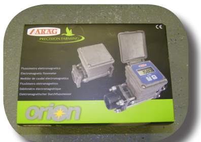
Orion Flow Meter