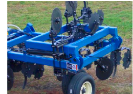
Flat fold outer wing with mechanical lock-down