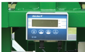
Optional Scale Head