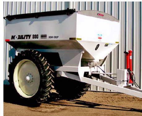
Mobility 800 (8 Ton)