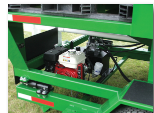
Self-Contained Hydraulic System