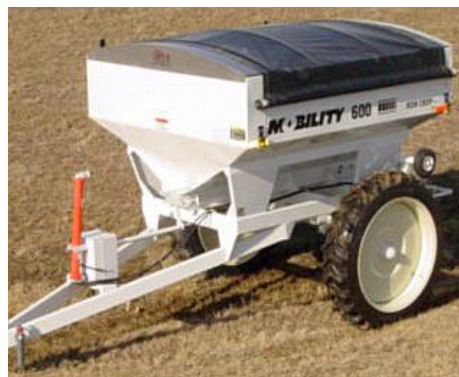
Mobility 600 (6 Ton)