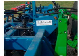
3 point hook-up