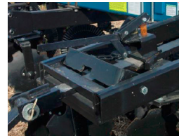
Pull out and swing away wagon hitch