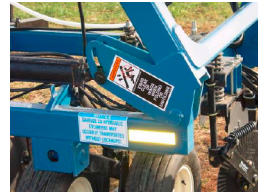
Heavy duty wing hinge with extra long hydraulic pin slot for extra wing travel – 2" greaseable pivot pins