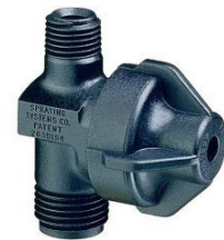
1/4" & 11/16" MPT QJ8360-NYB