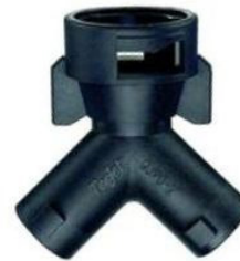
Y Adapter QJ90-2-NYR