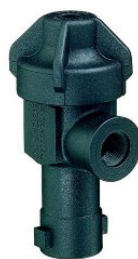
90° 1/4" FPT QJ8355-1/4-NYB