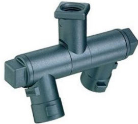
1/4" Double Swivel QJ8600-2-1/4-NYB