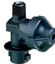
1/4" MPT QJ8360-NYB