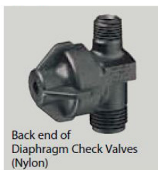
Back end of Diaphragm Check Valves (Nylon)