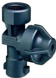
11/16" FPT QJT8360-NYB