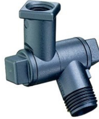
1/4" Single Swivel 8600-1/4T-NYB