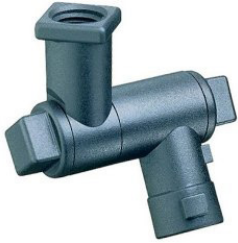
1/4" Single Swivel QJ8600-1/4-NYB