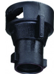
1" Extension 50854-NYB