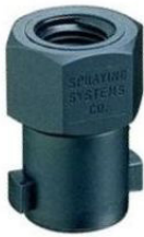
1/4" FPT = QJ1/4T-NYB 11/16" FPT = QJT-NYB