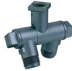
1/4" Double Swivel 8600-2-1/4T-NYB